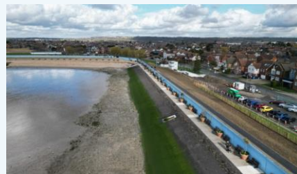
Footpath at Thorney Bay