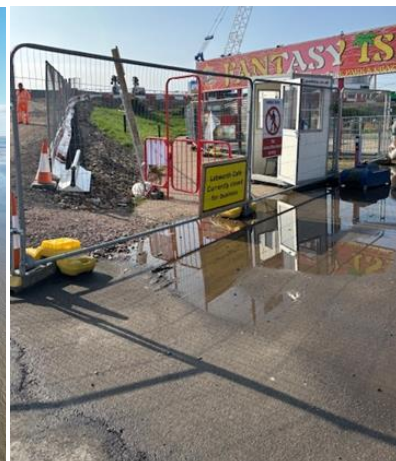
The footpath at Fantasy Island is currently closed and will open for the Easter weekend