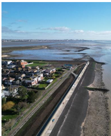
The footpath at The Point, Leigh Beck

There will be a staggered opening of other areas in the coming weeks.