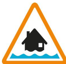
Prepare for flooding

There are three levels of flood warning: