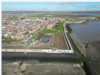
Footpath at Leigh Beck