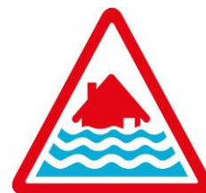
Deep fast flowing water Risk to life

Sign up online @ www.gov.uk/flood Or by phoning Floodline : 0345 988 1188 Or telephone: 0345 602 6340