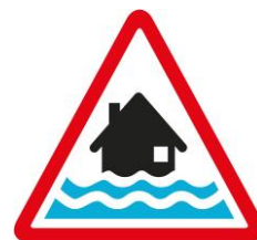
Flooding of homes/businesses is possible