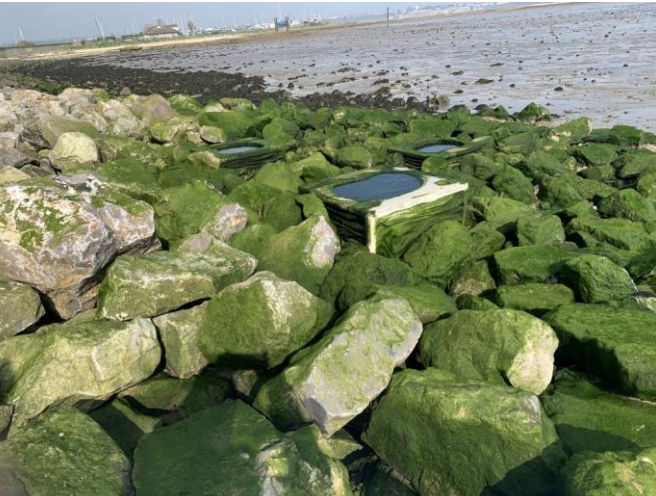
Rockpools at The Point