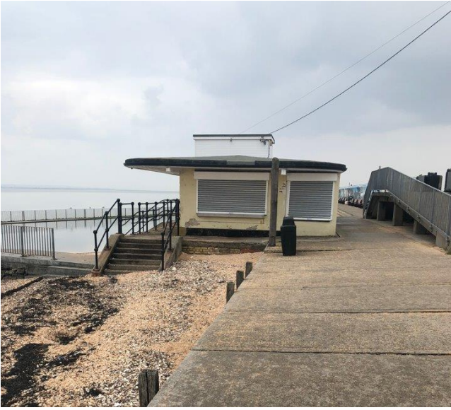
Concord Beach – before

Over the past two and a half years, we have published many progress images in this newsletter. Below is a small selection of images, covering locations before and after, the rockpools at The Point and community events.