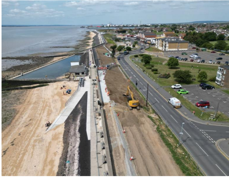
Concord Beach - after