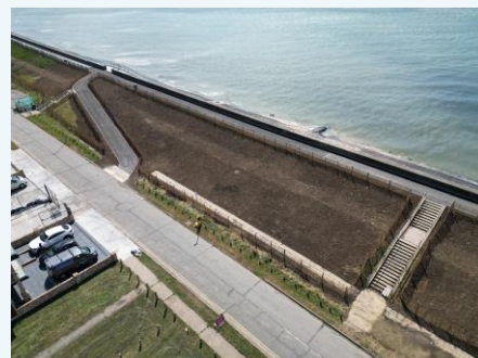
Photographs show the completed work for the Eastern Esplanade phase