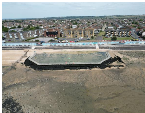
Concord Beach now the revetment has been laid