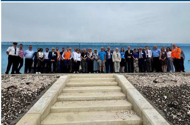
Stakeholders and collaborative partners celebrate the project's completion

The project team would like to thank all residents and businesses for their patience and cooperation while the work on the revetment took place.